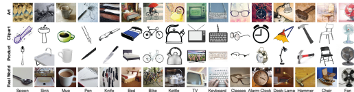
Figure 2: Examples of the Office-Home dataset.

Office-Home 1 [26] This dataset is to evaluate transfer learning algorithms using deep learning. It consists of images from 4 different domains: Artistic images ( A ), Clip Art ( C ), Product images ( P ) and Real-World images ( R ). For each domain, the dataset contains images of 65 object categories collected in office and home settings.